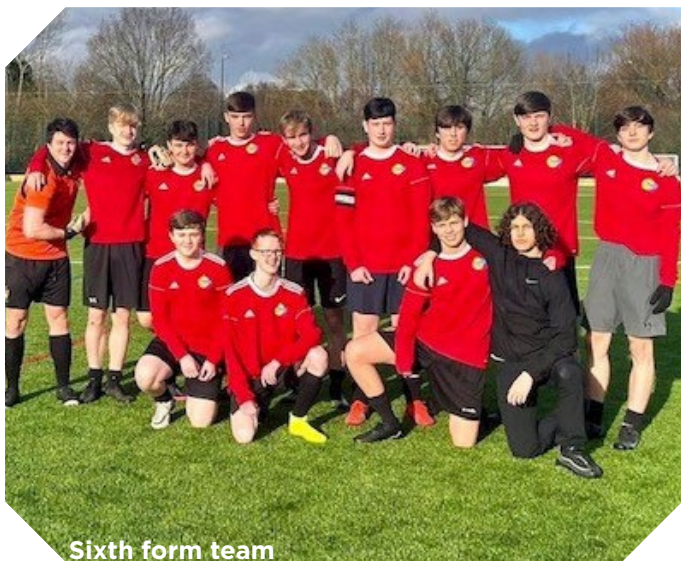
Sixth form team

We celebrated the opening of the pitch with a Sixth form v Staff football game. There was a great turn out from the players and supporters. Sixth form won 5-2! The staff have already started training for the next match as they are in dire need of it!