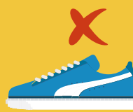
Trainer ( flat sole) Football Boot (blade)