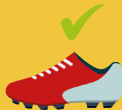
Football Boot (screw in stud) Football Boot (moulded stud)

Please remember that our new 3g pitch requires football boots to be worn