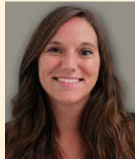
Miss Money Penny